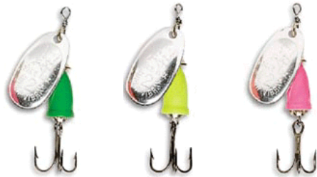
Blue Fox Vibrax Spinner (#5 and #6 for kings)